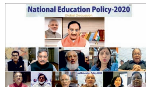
Dr. Ramesh Pokhriyal 'Nishank', Minister of Education, Govt. of India inaugurated an International Webinar on National