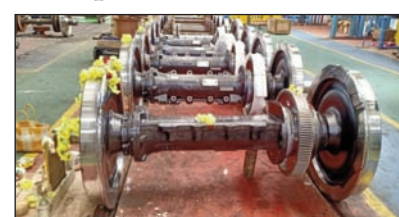
Mysuru Workshop of South Western Railway was established in 1924 as a base workshop of the erstwhile Mysore State Railway. The work shop has started

POH of BG coaches from 1994. With the introduction of LHB coaches on Indian Railways, workshop has been nominated to carry out Shop Schedule-1, Shop Schedule -2 and Shop Schedule -3 Schedules for the LHB coaches from 2012 onwards. Recently, Bharat Earth Movers Limited (BEM) had sought Mysuru Workshop to manufacture the 900 Trailer Coaches Wheel sets for 225 Trailer Coach Cars and 300 Motor Coach Wheel Sets for 75 Motor Coach Cars. BEM is manufacturing MEMU coaches for 8 car formation with Bombardier Propulsion System to ply between Ghaziabad and Delhi region. All the required Material including drill bits have to be supplied by BEM at their cost. The work consists of machining and pressing of wheel and Axle Assy.