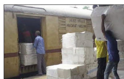
During the crisis arisen due to Covid-19, Western Railway is ensuring its best possible efforts, that there is no break in supply of essential commodities. Hence WR's parcel special trains are traversing across the country to keep the supply moving. Since the time of lockdown to contain the spread of the Coronavirus, it is a moment of big achievement that Western Railway has crossed the figure of 500 Parcel special trains by running total 504 Parcel special trains during lockdown, to different parts of the country to transport about 1.11 lakh tonnes of various essential commodities. In continuation to this, on 31st August, 2020 six parcel special trains, including a milk rake left from various stations of WR. These included 3 parcel specials viz Bandra Terminus to Jammu Tawi, Porbandar to Shalimar and Dewas to New Delhi; 2 indented rakes one from Karambeli to New Guwahati and the other from Kankaria to Benapal and a milk special rake from Palanpur to Hind Terminal.